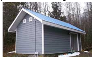
Industrial Electric Lawnmowers – Electric dumptruck – Village-Nakusp's Green Energy Micro Hydro plant.